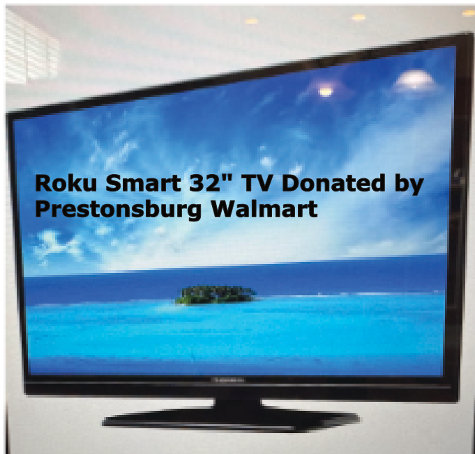
Roku Smart 32" TV Donated by Prestonsburg Walmart

The proceeds will go into a scholarship fund designed for the 2026-2027 graduating high school senior in getting a college education. senior towards their college education.