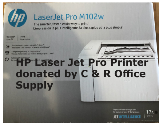
HP Laser Jet Pro Printer donated by C & R Office Supply